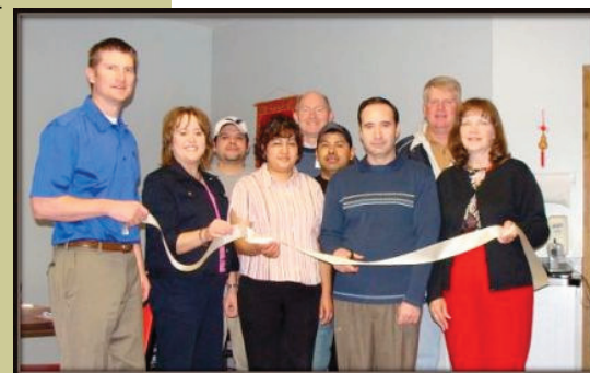
Ribbon cutting at Golden China.

10% Discount for Basehor-Linwood USD students and staff, 20% Discount for Fire, Police, and Military with ID or uniform.